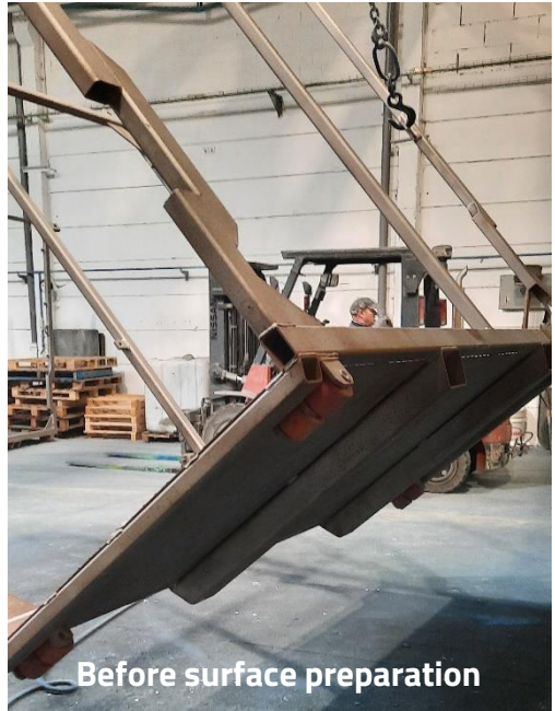
Before surface preparation