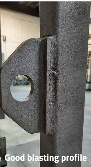
Good blasting profile