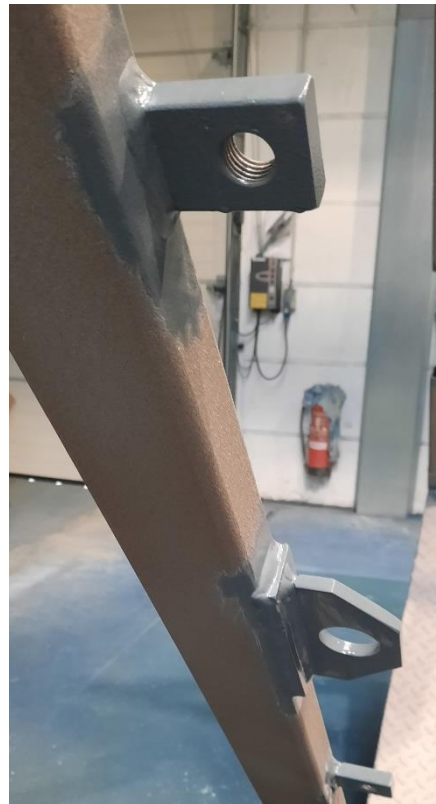
Left & above : After stripe coating