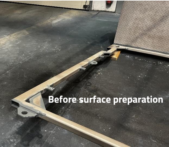
Before surface preparation

In February 2023 the METALYS company, specialist in blasting, metallizing and painting for 50 years, located in Deinze, Belgium, applied a ZINGA duplex system on 10 frames for prefab walls for one of their clients.